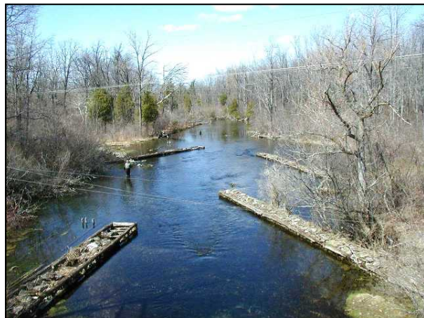
Spring Creek in the Black Creek Watershed.

See Black and Oatka Creeks: continued on page 5