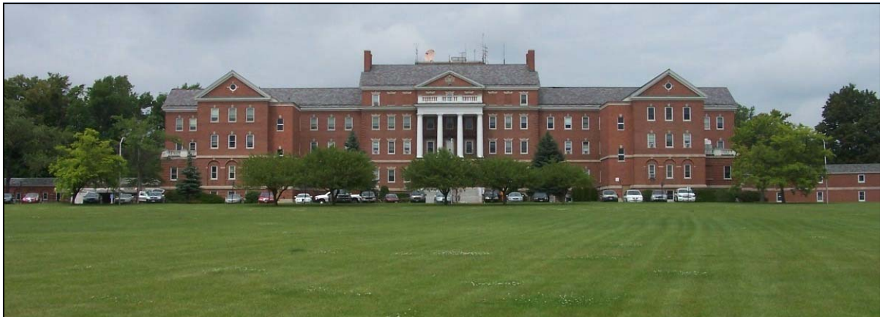
The Batavia VA Medical Center in Genesee County is representative of a modern campus with its elliptical organization of Neoclassical Style brick buildings towering above an open landscape.

G/FLRPC worked together with the nine County Planning Departments and County Historian's Office in the recommendation of cultural landscapes for this regional inventory. Based on National Park Service (NPS) standards, cultural landscapes are categorized by four types: historic designed landscapes, historic vernacular landscapes, historic sites, and ethnographic landscapes. A list of approximately 10 to 15 regions. See Inventory of Culturally Significant Areas: page 4