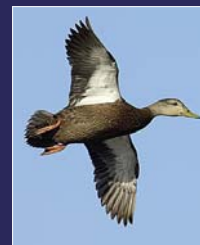
American black duck