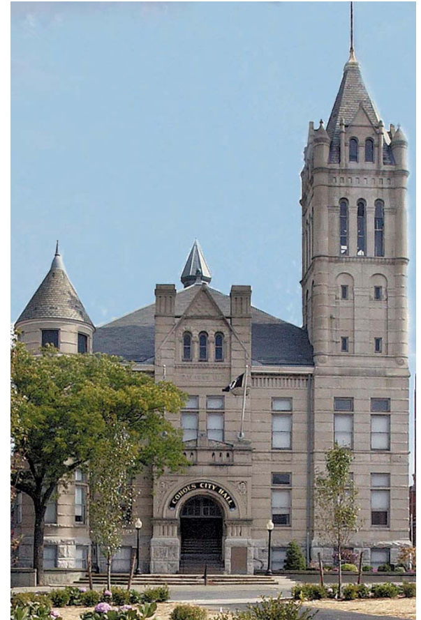
New York Department of State