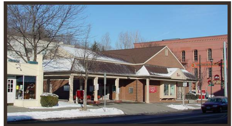
New York Department of State