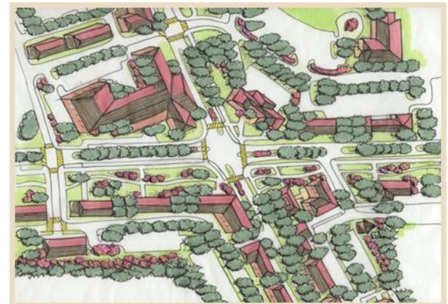
Town of Milton Town Center Plan