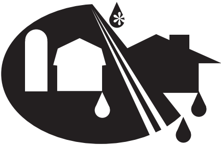
Ontario-Wayne Stormwater Coalition