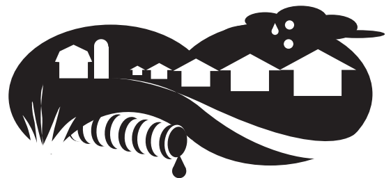
Ontario-Wayne Stormwater Coalition