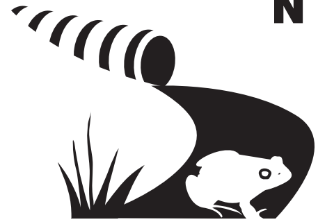
Ontario-Wayne Stormwater Coalition