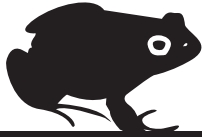
Ontario-Wayne Stormwater Coalition