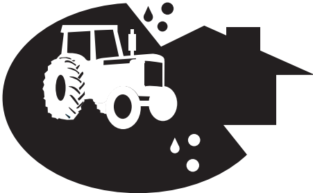
Ontario-Wayne Stormwater Coalition