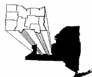
The G/FLRPC Region includes Genesee, Livingston, Monroe, Ontario, Orleans, Seneca, Wayne, Wyoming, and Yates Counties

"Blueways" are small boat and paddling routes that combine recreation and environmental awareness and allow users to travel to designated stops along the way for rest, overnight stays, and enjoyment of land-based attractions in the vicinity. G/FLRPC, through the Genesee-Finger Lakes Regional Blueway Analysis project, will seek to identify, describe and rank lake, canal and riparian corridors throughout the nine-county Genesee-Finger Lakes Region based upon their suitability for blueway use and designation.