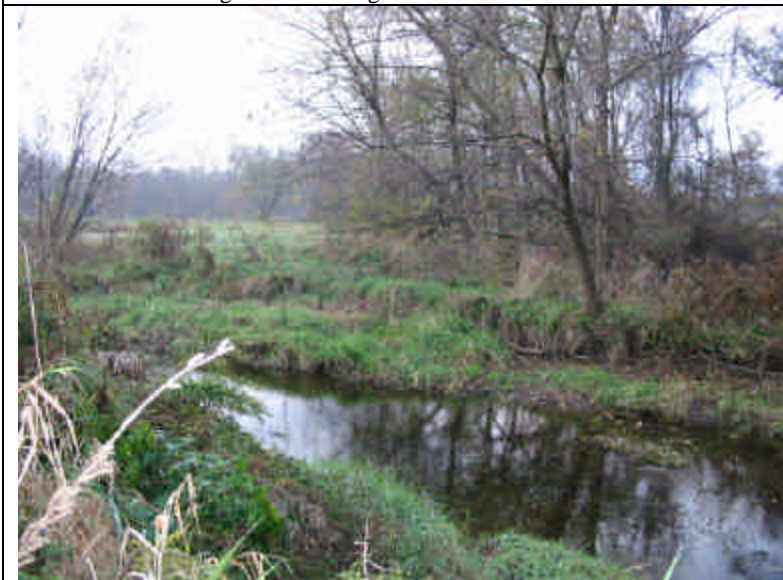
Photo 3. Frequent bankfull flows have caused sloughing of west bank into formerly stable section of stream channel, causing formation of mid-channel bars. Diversion of current around the mid-channel bars contributes to bank undercutting and instability.