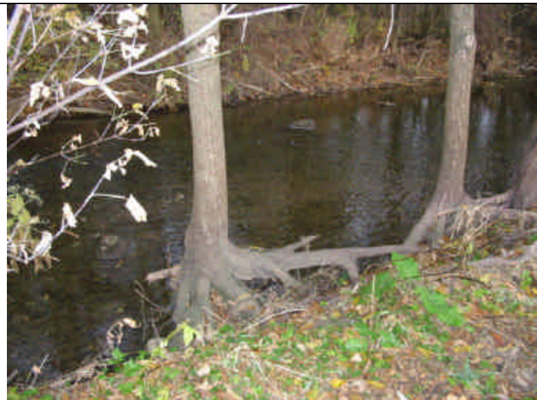
Photo 4. Scouring and undercutting have exposed root systems of numerous trees lining the stream channel.