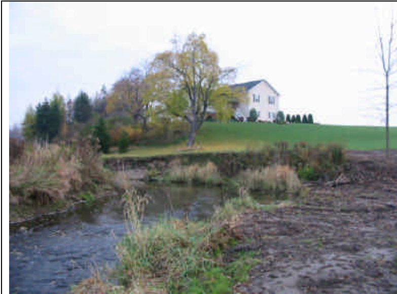
Photo 1. View of project site showing exposed soil on high, undercut bank at outside edge of meander, near Station 4+00, looking northeasterly. Bare soil at photo right is due to mechanical vegetation clearing.