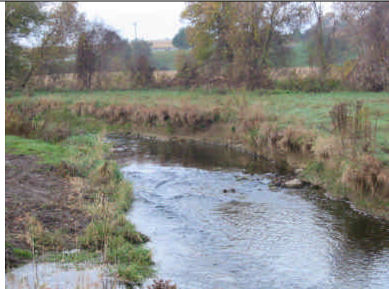
Photo 2. View of exposed soil along west bank of creek at Station 2+10, looking south. Bank height is approximately 2-2.5 feet above water level.