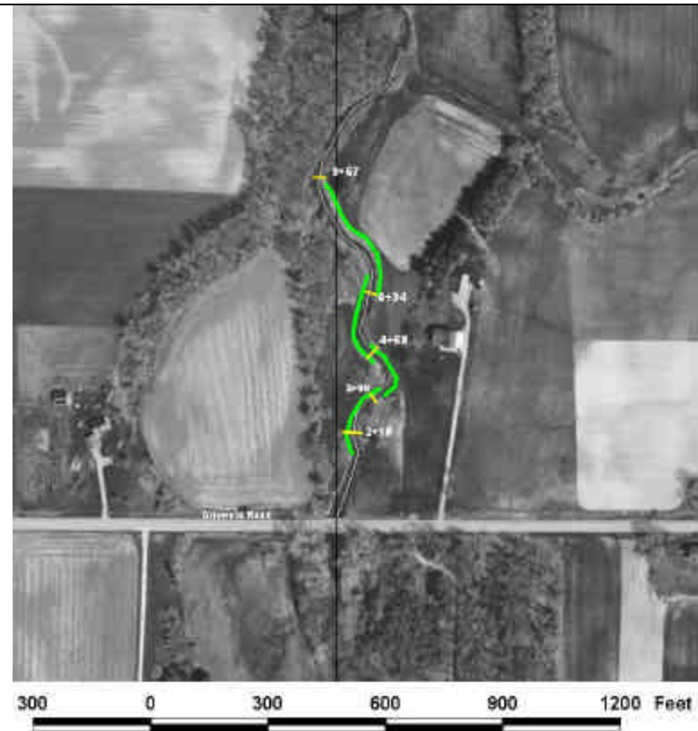
2002 Air Photo, Black Creek at Griswold Road