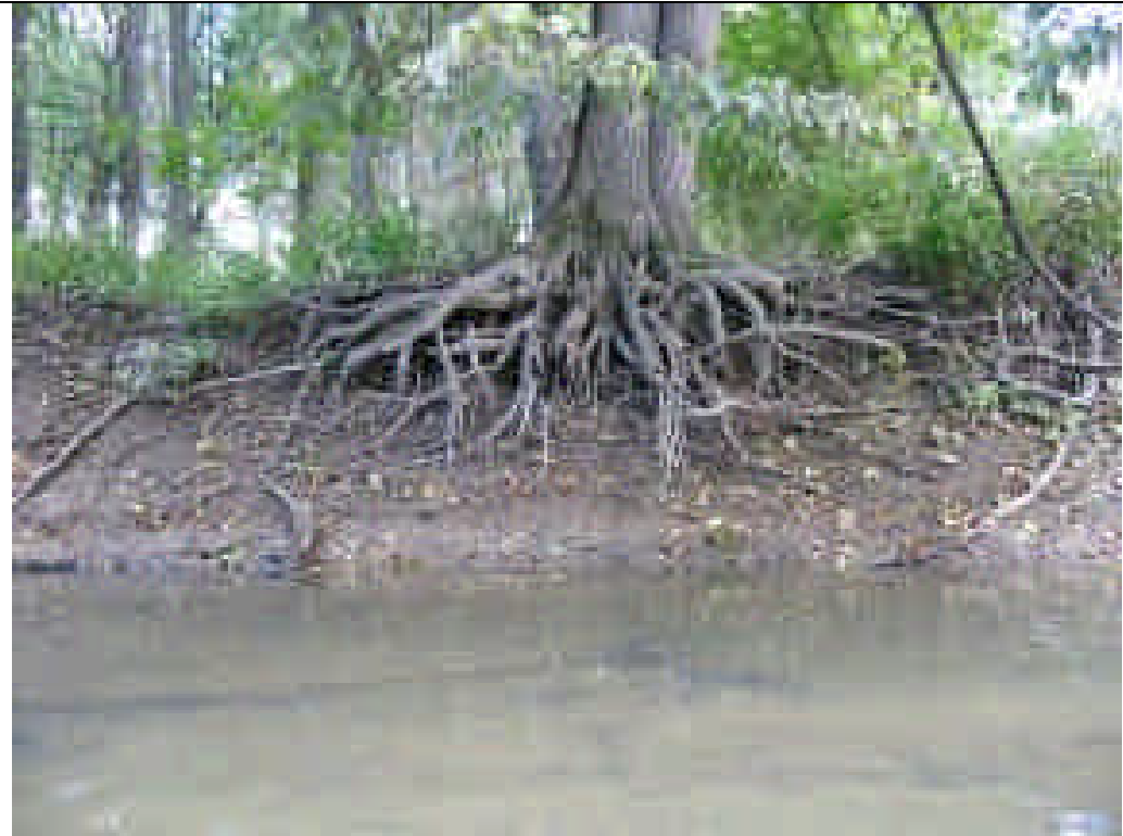
Photo 2. Detailed view of exposed roots on large silver maple tree on east bank of Oatka Creek at Pavilion. This condition is typical of many large trees along the bank. Located on the outside curve of a meander, the roots are undercut when the channel flows at bankfull. Frequent bankfull flow conditions exacerbate undercutting and cause trees to fall into the channel.