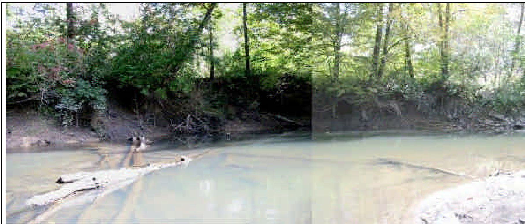
Photo 3. Panoramic view of exposed bank along outside edge of meander adjacent to Rochester & Southern Railroad tracks. Note the accumulation of large woody debris, high exposed soil banks.

Site Description: This reach of Oatka Creek is located immediately west of the Rochester and Southern Railroad tracks in the hamlet of Pavilion in Genesee County. The railroad embankment has limited the eastward migration of a meander at this location. The channel forms a sharp curve around this site. The channel gradient is estimated at 0.0018 ft./ft through this section, dropping less than 10 feet over a distance of more than 5000 linear feet. A single, perennial tributary forms a confluence with the Oatka main channel just south of the project reach. Oatka Creek flows through a broad, relatively flat-lying flood plain between Wyoming and Pavilion. Agricultural fields are often cultivated as close to the top of the stream bank as possible. Vegetated riparian zones, where they exist, are generally thin (less than 15 feet) from the edge of the field to the stream channel top of bank). As a result, the stream channel carries a heavy suspended sediment load in this reach.