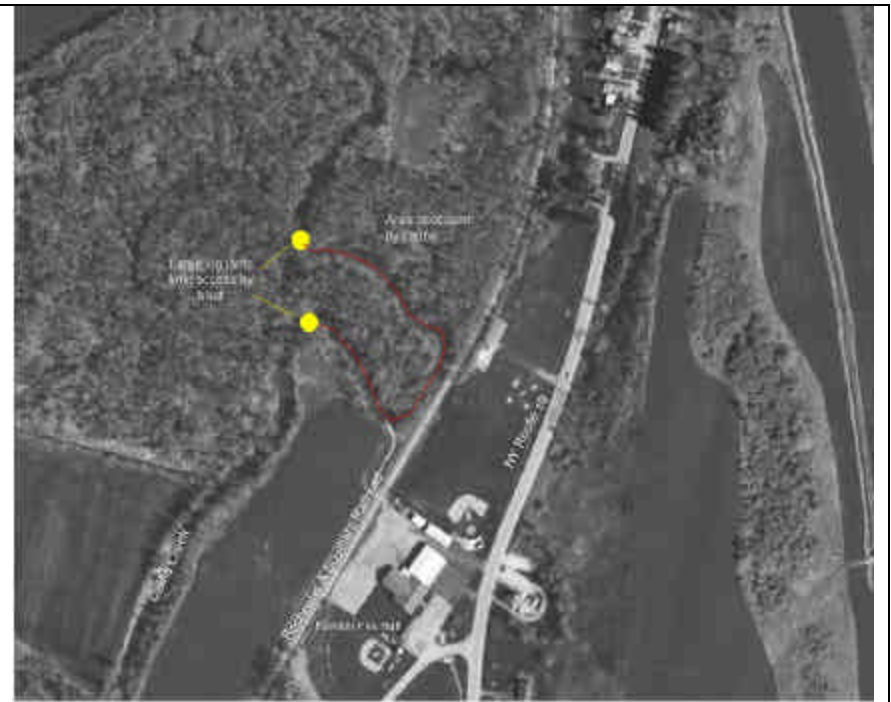
Aerial view of Oatka Creek near the Pavilion Fire Hall, Town of Pavilion, Genesee County