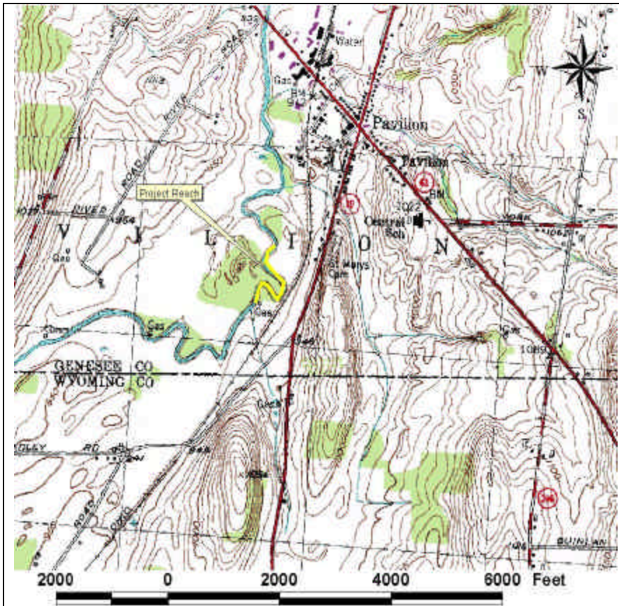
Location of Site E-006, Oatka Creek south of hamlet of Pavilion, Genesee County