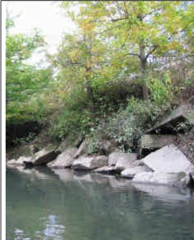
Photo 1. Detailed view of Rochester & Southern Railroad embankment adjacent to Oatka Creek south of Pavilion. Note placement of large concrete blocks, stones and rip rap to protect toe of slope.